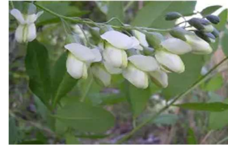
Wild White indigo